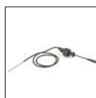
Flow switch included