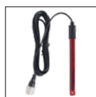
Redox probe kit as standard