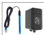
pH kit as standard