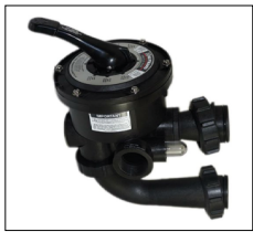
Vari-Flo™ 6-way valve

Drain with plug that also serves as a dismantling tool